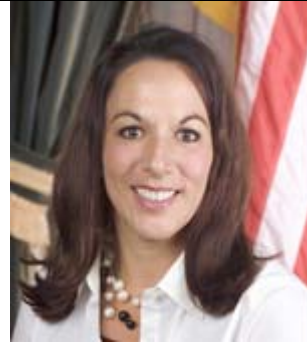
Senator Beatrice A. Lanzi Secretary