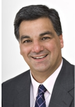
Senator Paul V. Jabour