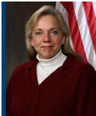
Senator V. Susan Sosnowski

Chairwoman, Senate Committee on Environment & Agriculture