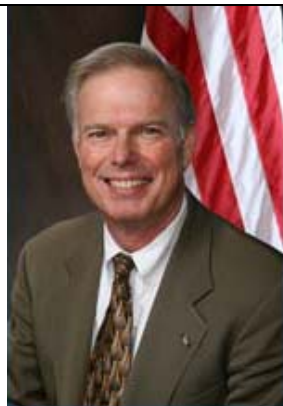
Senator William A. Walaska