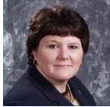
Senator Maryellen Goodwin