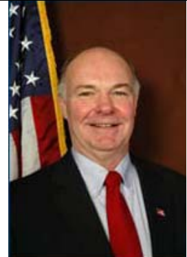
Senator Glenford J. Shibley