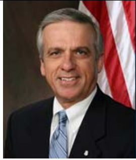
Senator Marc A. Cote