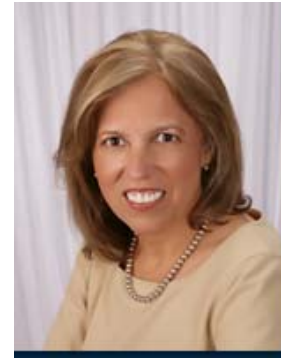
President of the Senate