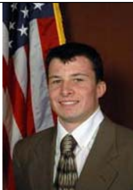
Senator Nicholas D. Kettle