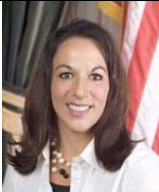
Senator Beatrice A. Lanz Secretary