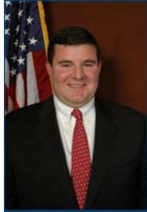
Senator Dawson T. Hodgson