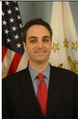
Senator Daniel DaPonte