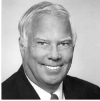
Senator David E. Bates