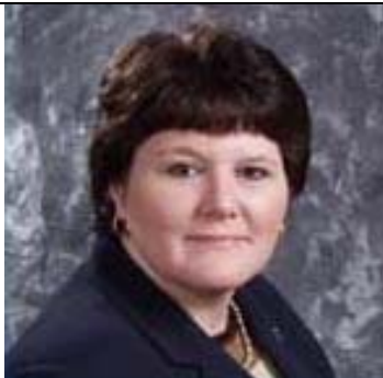
Senator Maryellen Goodwin