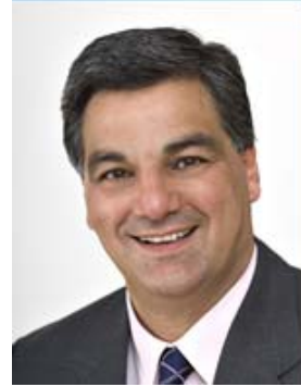
Senator Paul V. Jabour