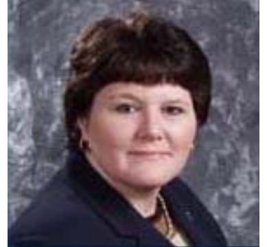
Senator Maryellen Goodwin