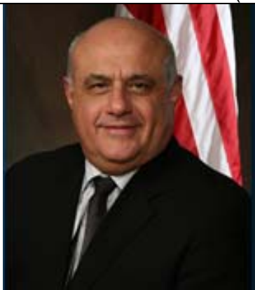
Senator Frank A. Ciccone, III