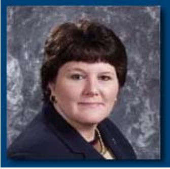
Senator Maryellen Goodwin