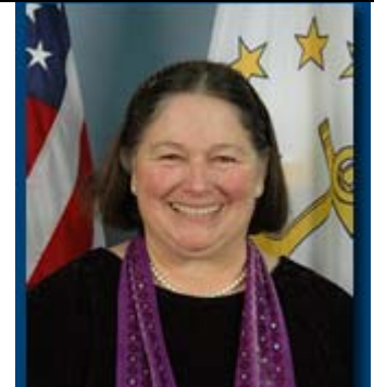
Senator Rhoda E. Perry