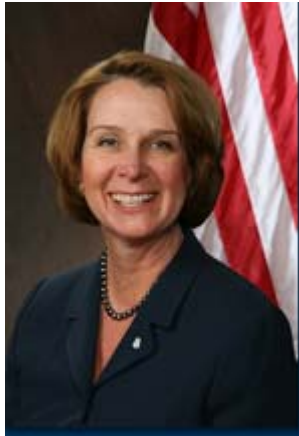
Senator Hanna Gallo

Chairwoman, Senate Committee on Education Member, Senate Committee on Corporations