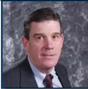
Senator Paul W. Fogarty