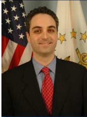
Senator Daniel DaPonte