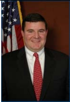
Senator Dawson T. Hodgson