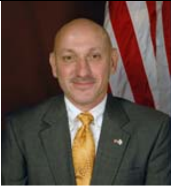
Senator Louis P. DiPalma