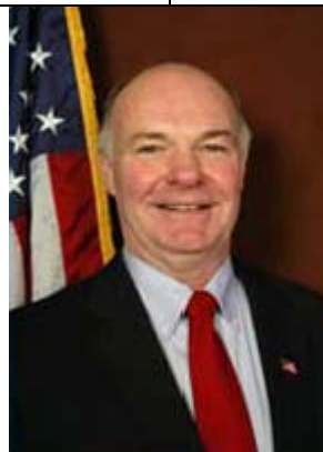
Senator Glenford J. Shibley