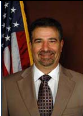
Senator Frank Lombardo, III