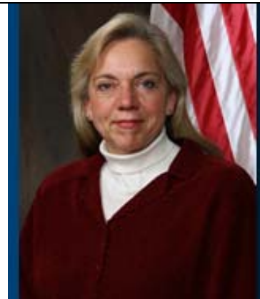
Senator V. Susan Sosnowski