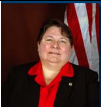
Senator Elizabeth A. Crowley